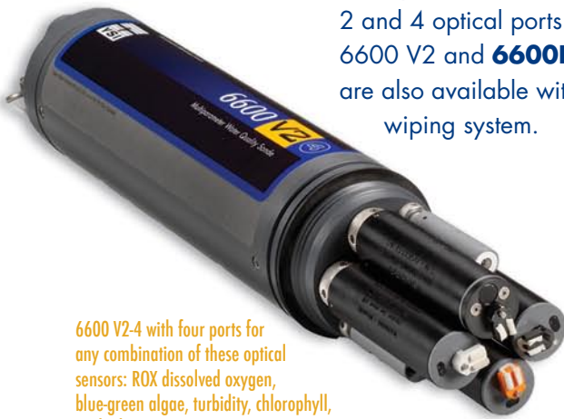
6600 V2-4 with four ports for any combination of these optical sensors: ROX dissolved oxygen, blue-green algae, turbidity, chlorophyll, or rhodamine

6600 V2 sonde features the largest sensor payload capability and longest battery life. Choose between 2 and 4 optical ports. The 6600 V2 and 6600EDS V2 are also available with a pH wiping system.